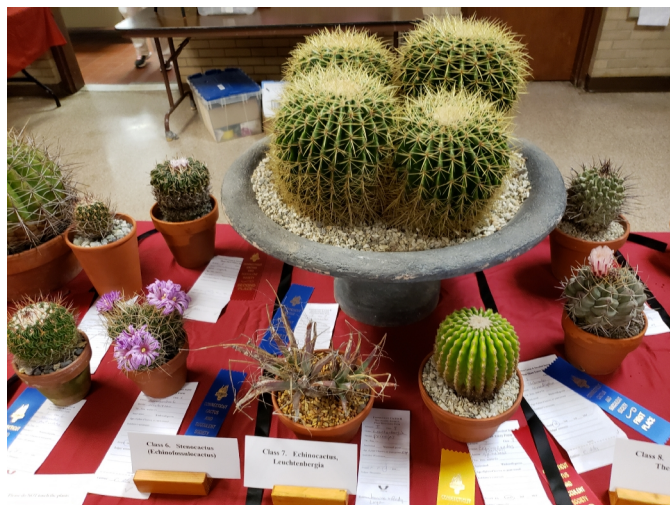
Entrants in the Class 6 Stenocactus & Class 7 Echinocactus categories