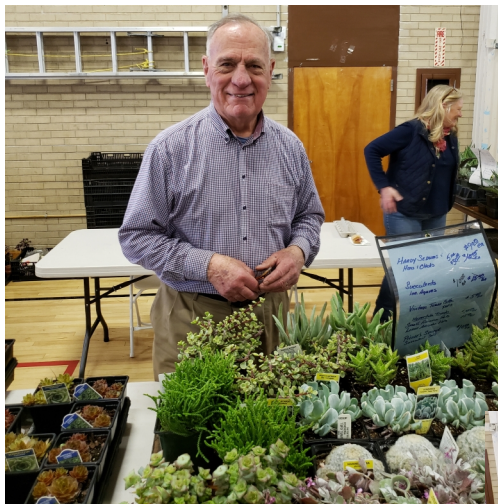
Pierre of Sunny Border Nurseries, Inc. Visit them at www.sunnyborder.com .