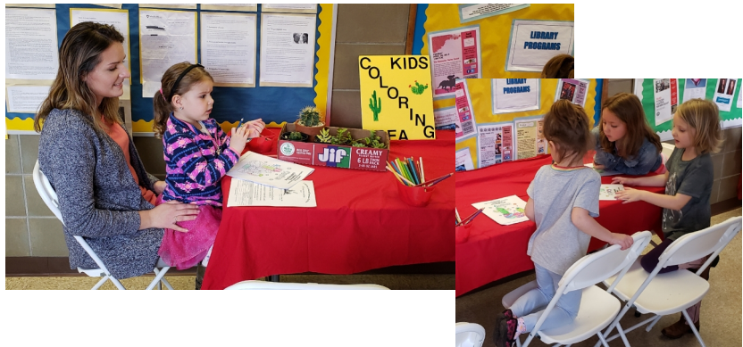
Children enjoyed the cacti-themed coloring books at the "Kids Coloring Area".