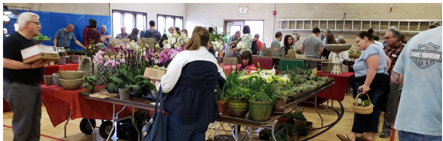
Sales were hot in the vendor sales area.