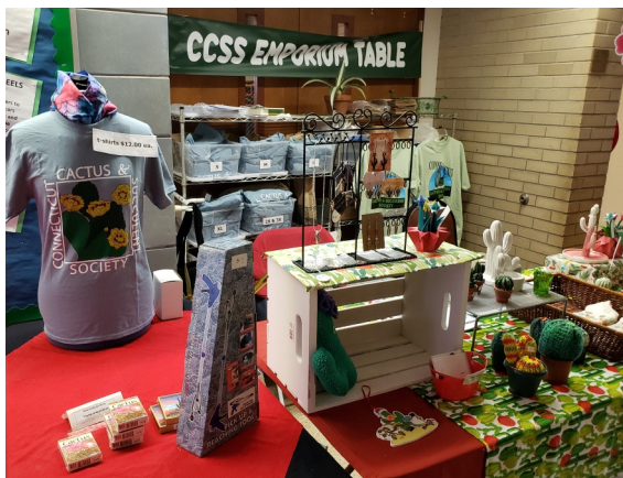
The CCSS Emporium Table offered club t-shirts, various cactus-themed home decorating items, jewelry, playing cards and prickly pear cactus candy.