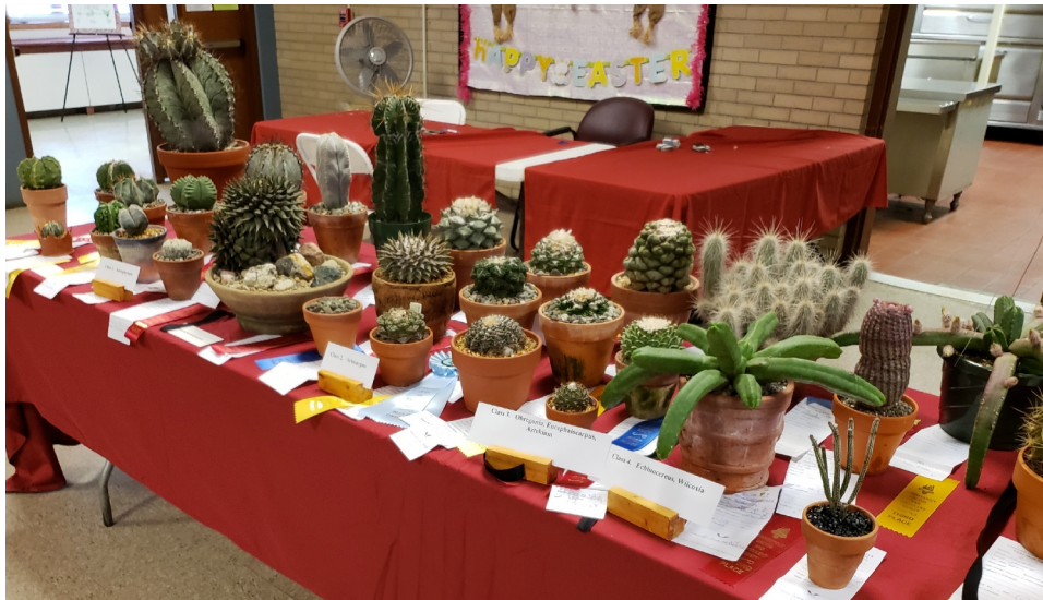
Some of the many examples of cacti that members submitted for judging.

Our judged Show Room was filled with spectacular plants, as always.